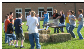
Ag students along with elementary students are performing the chicken dance to add to the chicken demonstration.