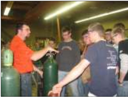
Ag. Mechanics class is learning safety tips on how to weld.