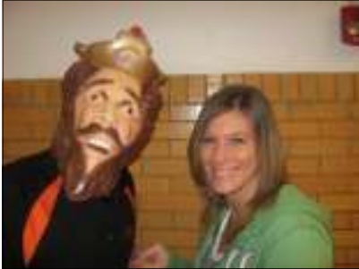
The real King and Queen.