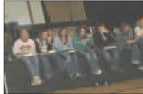
Sophomores enjoying their pizza party.

ticipated in the successful canned food drive. It was great to see everyone join together and rise to the cause as a district to help less fortunate families have a happier Thanksgiving.