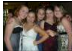
These girls are having a blast!!