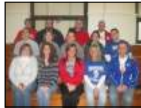
Alumni Group Photo

higher education to Whiteoak students. Funds that helped make this day possible were provided through OACHE.