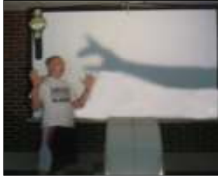
WHEN SHADOW ANIMALS ATTACK!