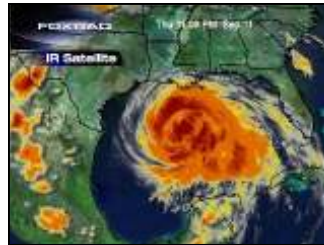
Radar showing Hurricane Ike

cane. A lot of damage also occurred in this region, and many roads were blocked by fallen trees.