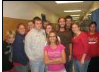
The JOGs Officers

The students will be planning events for the civic, leadership, career and social activities.