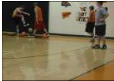
Students learning how to play Base Soccer.