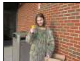
B.Y.O.B. Bring Your Own Root Beer