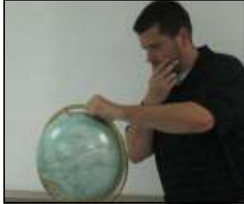
The original "Spinner."