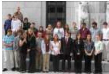
Students posing in front of the Ohio Supreme Court building.

out of a boat in Lake Erie. During the tour, students participated in an evidence workstation, which demonstrated how what people say might not always be true. They also visited a display of court cases that had been reviewed in class and participated in a mock trial where students fill-in as jury, judge, prosecutor, and defense attorneys. It was a great experience and very educational!