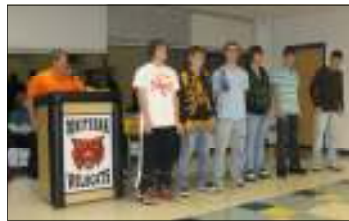
Boys Cross Country Team.