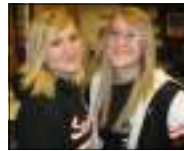
"Figure Skating." —The Twins