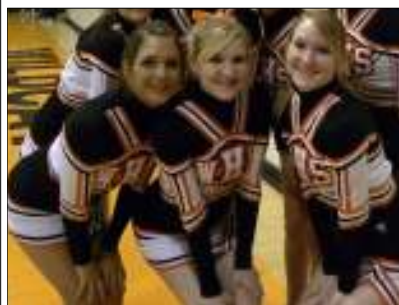
Senior cheerleaders on Senior Night.