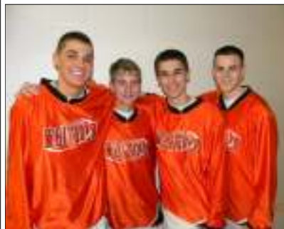
Senior boys basketball players on Senior Night.

Friday, March 26, is the end of the 3rd 9 weeks. 1-hr early dismissal on this day.