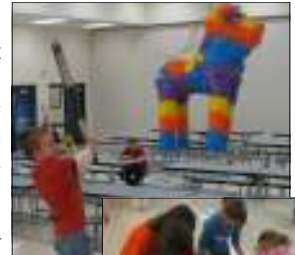
Breaking the Piñata!