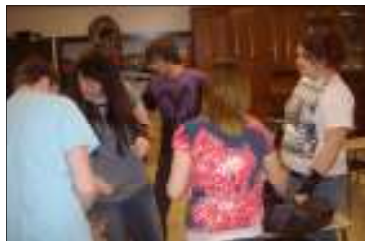
Some of the students help put gift packs together from The "I" Team for the OGT takers! Good luck!

An earthquake struck Turkey early Monday morning. The U.S. Geological Survey registered the quake at a magnitude 5.9. At least 40 people have been confirmed dead and over 100 injured. Relief effort crews have already been deployed to help those who are homeless or in need. An earthquake also hit off the shore of Hawaii Monday afternoon. The quake was classified as a 4.4-magnitude. Luckily, no one was hurt.