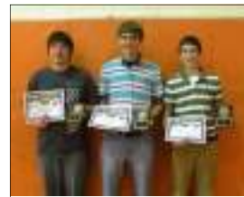
H.S. Students of the Year (above), and J.H. Students of the Year (below).