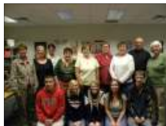
Computer Basics Participants

stations. For completing the Computer Basics Course class, the adults received a certificate and a jump drive from the students at the end of the month. It was a good experience for both the students and the adults and something that the students will continue to do every year for the community. This program was funded by the Learn and Serve Ohio Grant.