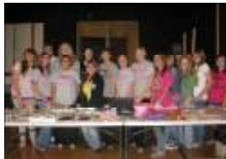
High school volleyball girls posing for a picture during the bake sale.

This past Monday was the Volley for the Cure game. Through weeks of fundraising, Whiteoak and Lynchburg-Clay raised over $2,300! People packed into the gymnasium, all sporting support with a pink article of clothing. Also, congratulations to the JV Varsity girls for winning each of their matches, JV in two straight sets and Varsity in three straight!