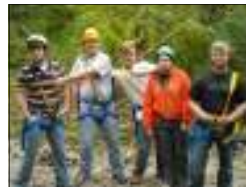
JOG students ready to go up the course.