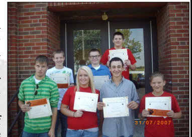
September Students of the Month.

of you! You are great representatives of an awesome student body! The junior high will have a Welcome Back party on September 17 th at 1:30. There will be music, games and corn hole. We'll have pictures for next week's edition of the Weekly Wildcat. We have also had lots of snacks for the teachers...we want to make everyone feel welcome and valued!